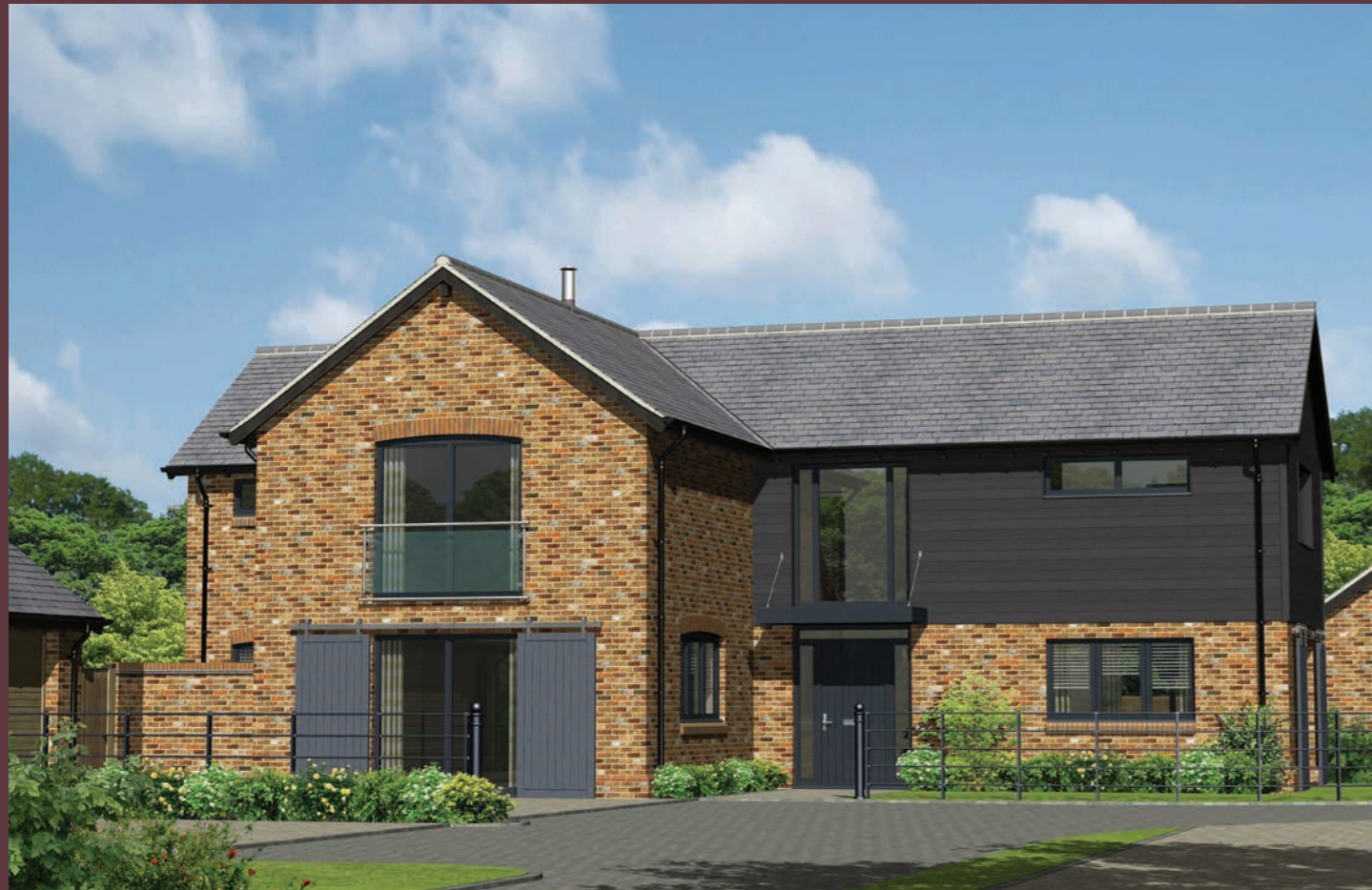
Artist's impression / Plot 9 shown - Plot 8 is a mirror image

The Hopton has the benefit of being a new, modern, five bedroom spacious family home but with the appearance of a cosy, stylish barn conversion. This is perfect for those who wish for generous size modern living in a countryside setting. There is a large kitchen and family room with French doors onto the patio and garden. The living room with feature fireplace and bifolding doors on to the patio can be accessed via the dining hall or the kitchen, creating a very sociable home. The snug, dining hall and living room are all individual rooms, giving flexible living space. All five bedrooms are double rooms and two have ensuite bathrooms. The master bedroom has dual aspect windows. Externally the prominent home has gardens surrounding the property, a double garage and a good size driveway for parking.