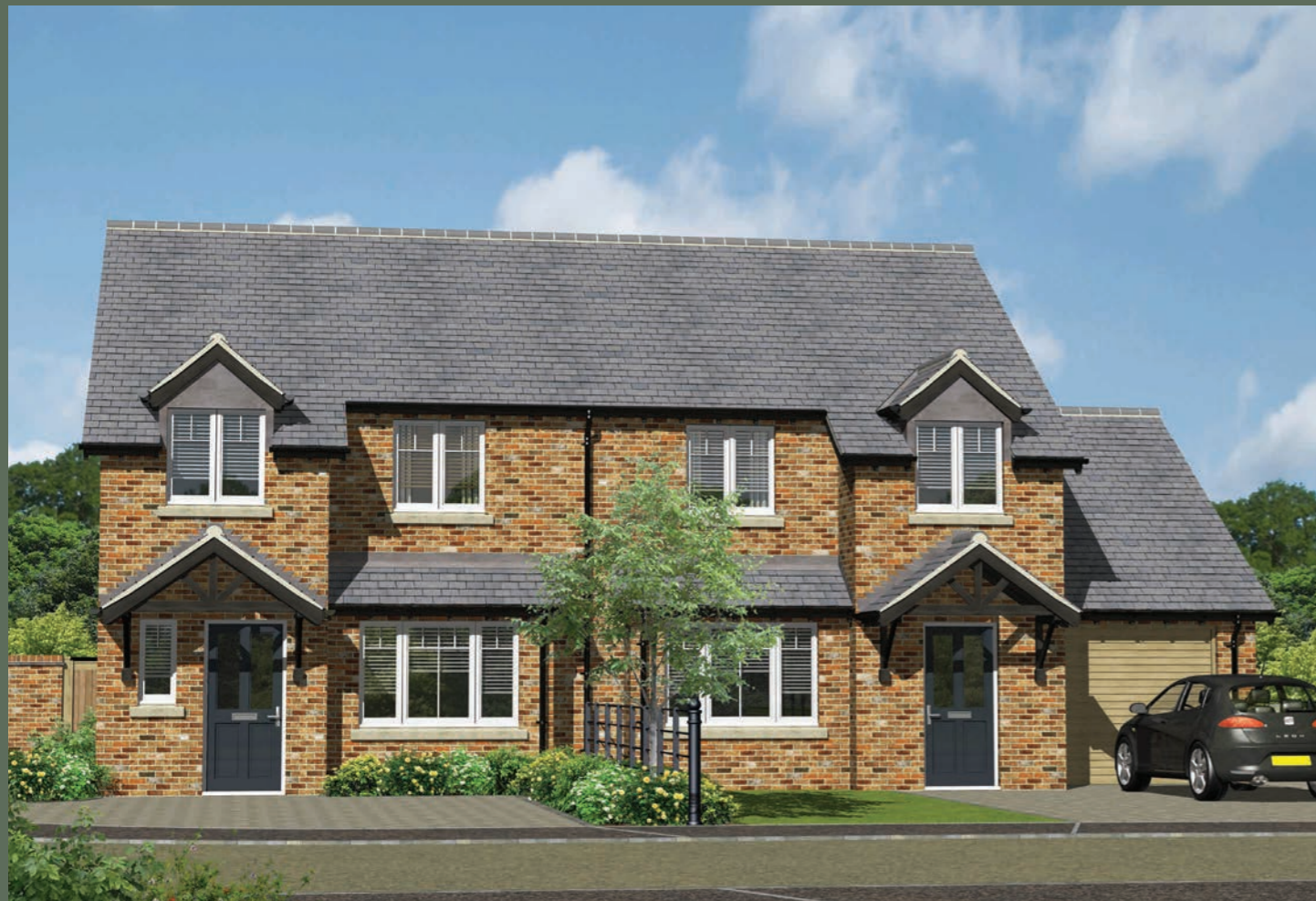
Plots 15 & 16 / Artist's impression

The Montford is a three bedroom, two bathroom, semi-detached house with an open plan kitchen/dining room and separate living room. French doors open onto the rear garden from the dining room. On the first floor there are three bedrooms. The master bedroom has an ensuite shower room.