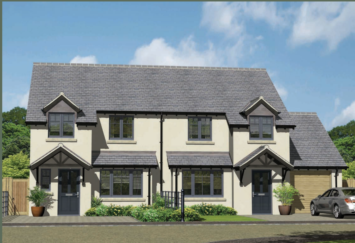
Plots 4 & 5 / Artist's impression

The Rednal offers a modern kitchen/dining area and a living room on the ground floor with the added benefit of a utility room and integral garage. On the first floor the master bedroom has an ensuite bathroom and two further bedrooms.